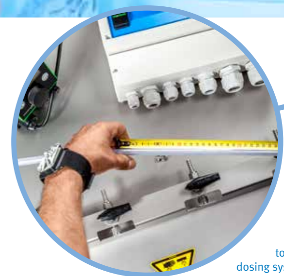
Tailored precisely to our customers' needs: dosing systems from Dr. Weigert.

Our customers' quality assurance systems are also optimised at the same time – under- or overdosing is virtually impossible. Another major advantage of Dr. Weigert's dosing technology is that it enhances customers' staff safety. We hold a wide range of customer training sessions every day because it is crucial that clients use our products correctly to achieve the best results and protect the environment. This form of dialogue and collaboration embodies Dr. Weigert's concept of customer focus.